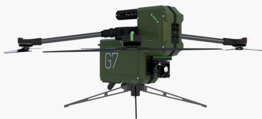
Grabbit G7 V4